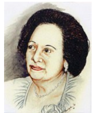
Lamar Bruni-Vergara Foundation